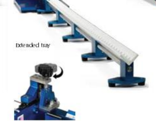
Precise spring loaded 2-position head